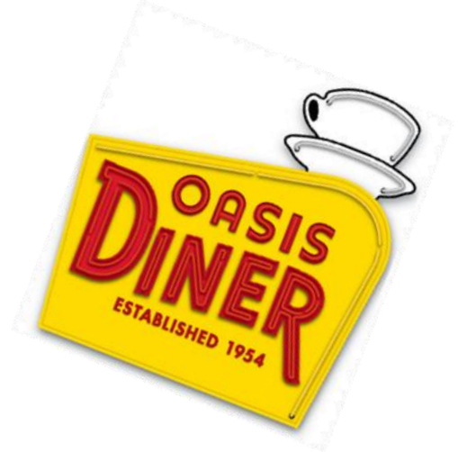
2016 Quaker Day Best in Show